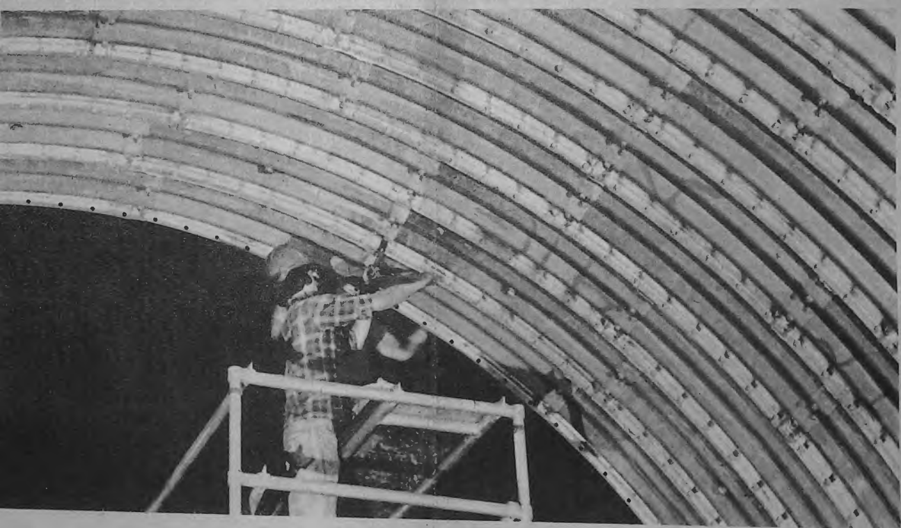
STEEL LINING is being installed inside the Hoosac Tunnel in North Adams to reduce groundwater leakage onto tracks. Story on Page 24.