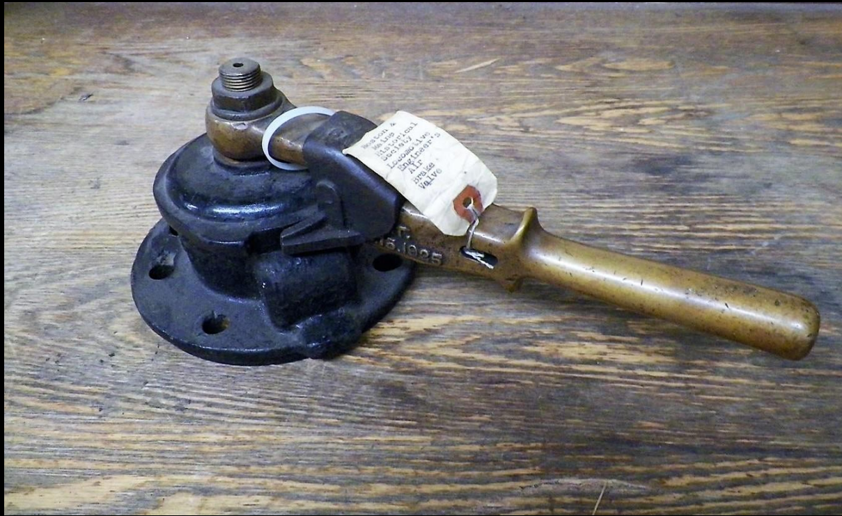
Brass Brake Handle